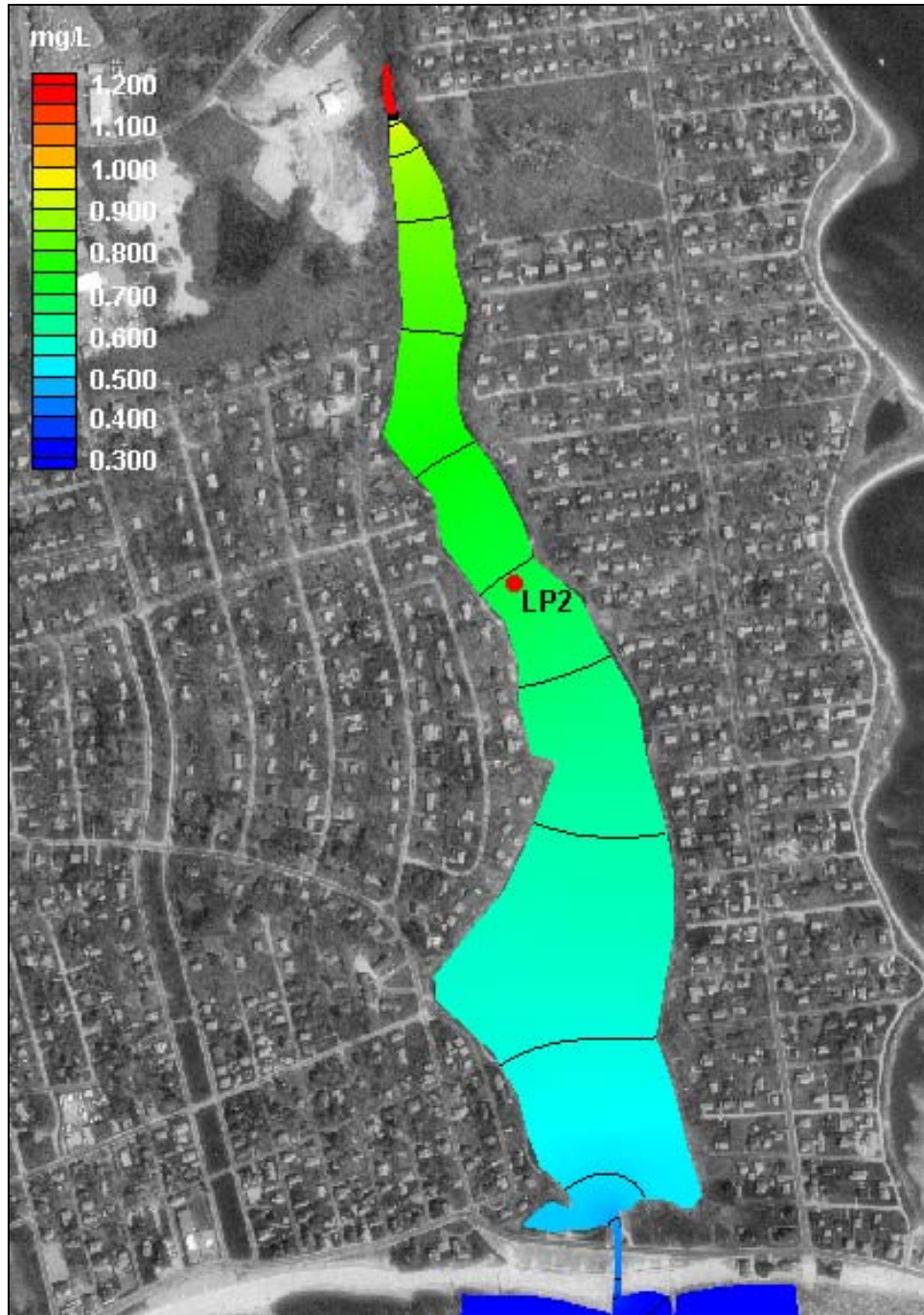
Figure IX-2. Contour Plot of modeled total nitrogen concentrations (mg/L) in Little Pond, for present loading conditions, and widened inlet channel (20 ft). The approximate location of the sentinel threshold station for Little Pond (LP2) is shown.