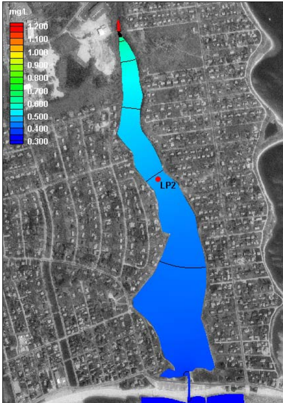
Figure IX-3. Contour Plot of modeled total nitrogen concentrations (mg/L) in Little Pond, for widened inlet threshold scenario (lower watershed) loading conditions, and widened inlet channel (20 ft). The approximate location of the sentinel threshold station for Little Pond (LP2) is shown.